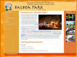
XHTML & PHP